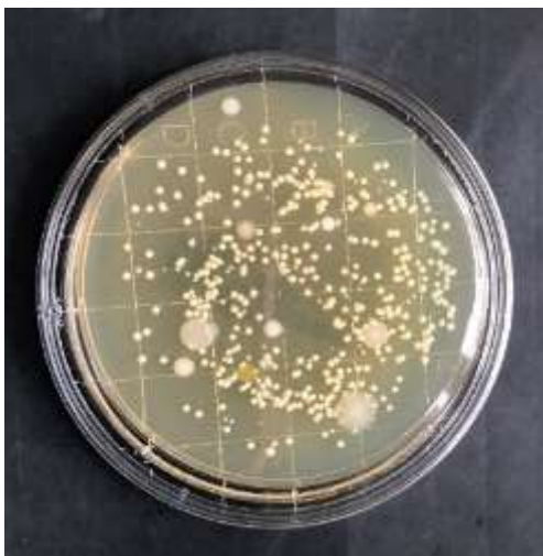
WITHOUT nanosilver active ingredient

and showed a reduction of up to 99.99%. The effectiveness depends on the concentration of the active ingredient.